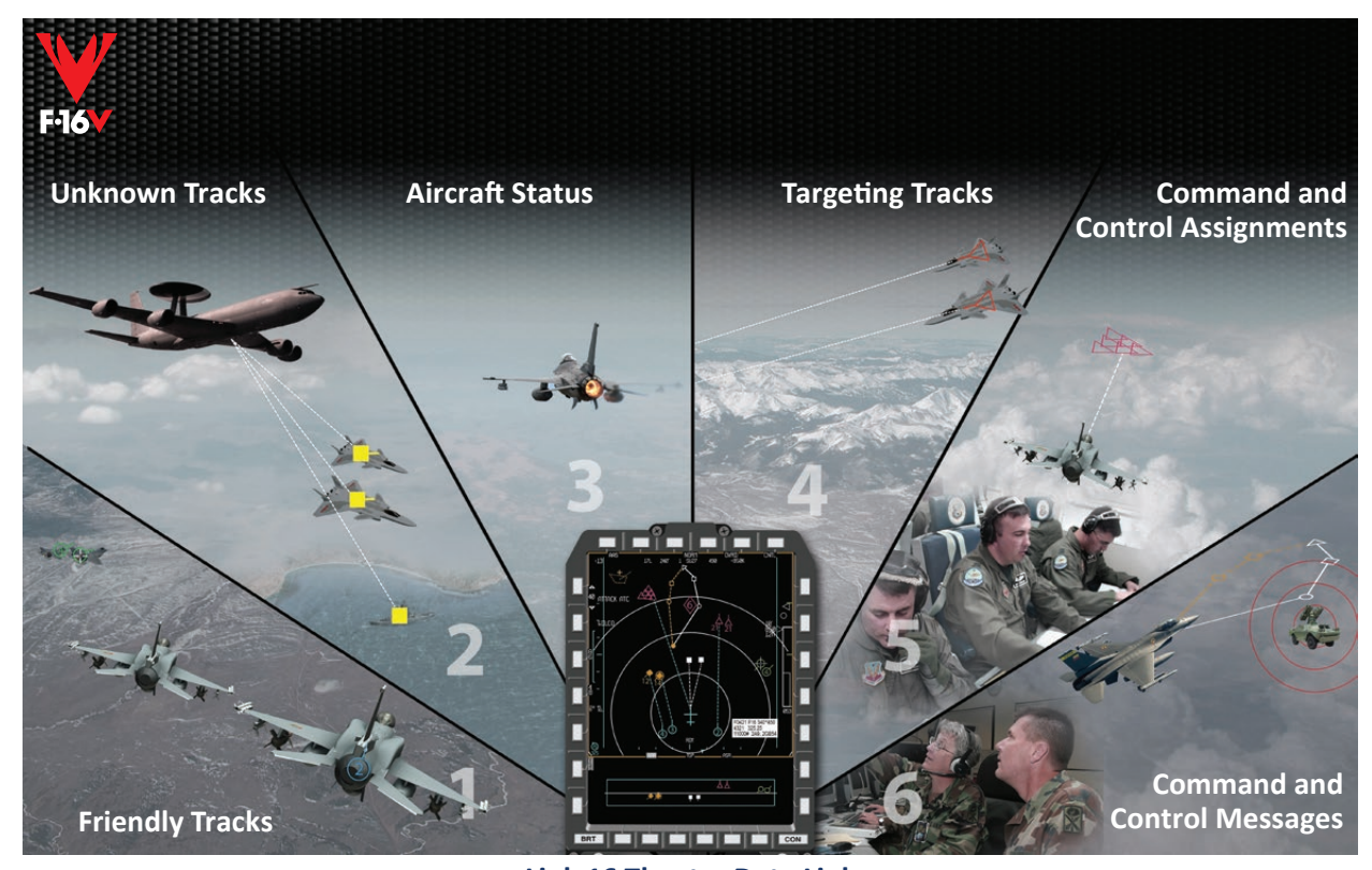
Link-16 Theater Data Link

The Lockheed Martin F-16V configuration provides relevant combat capabilities in a scalable and affordable package. The core of the F-16V configuration is an Active Electronically Scanned Array (AESA) radar, a modern COTS-based avionics subsystem, a large-format 6 x 8 high-resolution display and a high-volume, high-speed data bus. Operational capabilities are enhanced through incorporation of the Link-16 Theater Data Link, SNIPER Targeting Pod, Advanced Weapons, Precision GPS navigation and Auto Ground Collision Avoidance System.